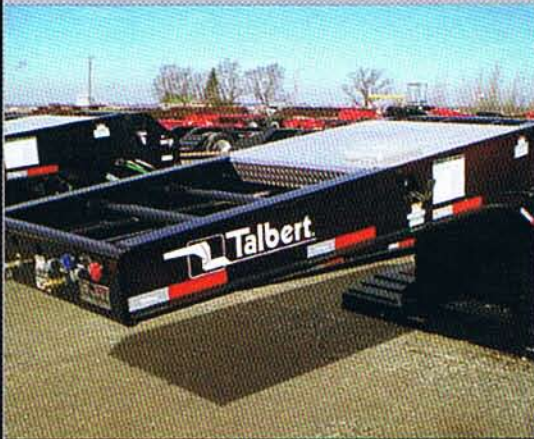
ALUMINUM GOOSENECK COVER PLATE (STANDARD)