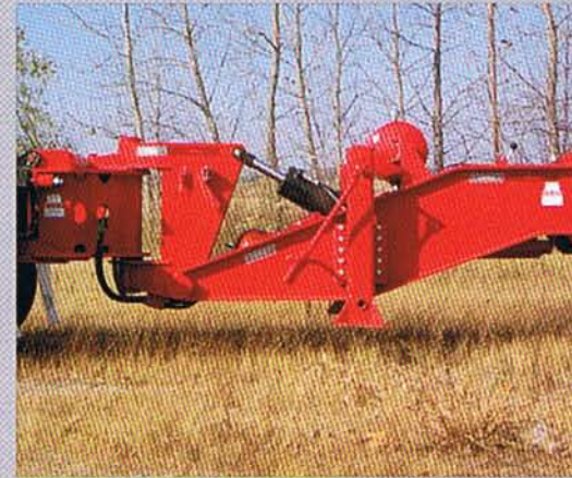
AXLE ATTACHMENT EQUALIZER SYSTEM (OPTIONAL)