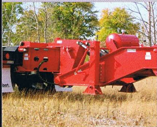
DUAL 2-SPEED LANDING GEAR