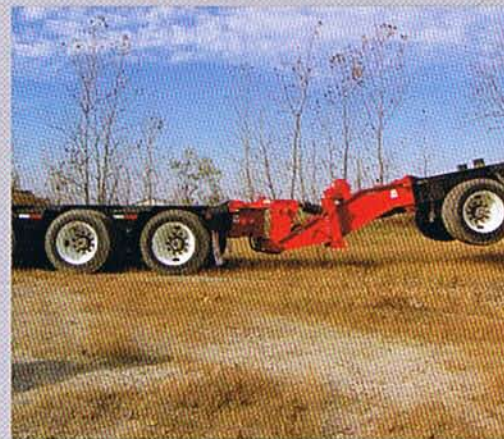
LIFT AXLE FOR EASY BACKING